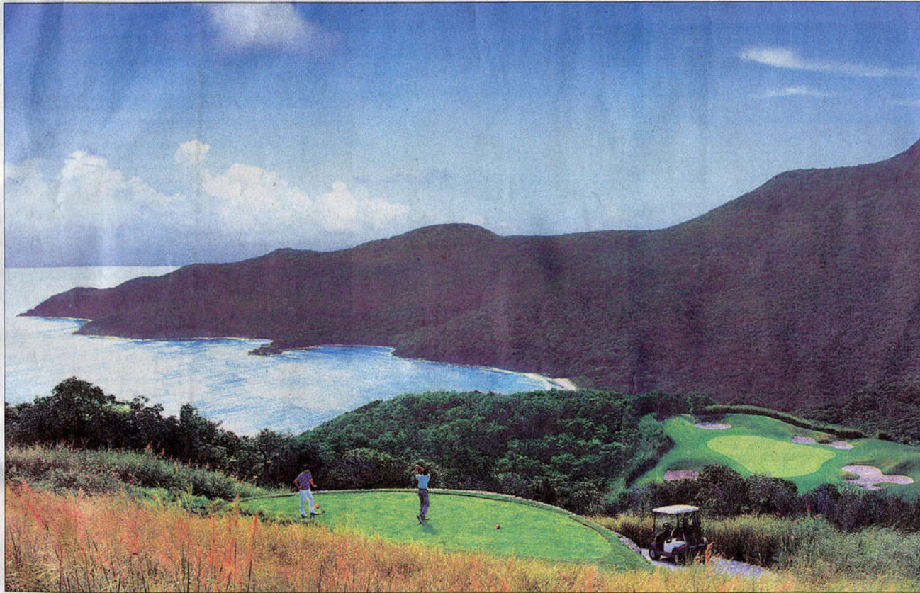
Take the rough with the smooth: tee-offs can be tricky at the Canouan resort, where the course rises dramatically from sea level to the rim of an extinct volcano